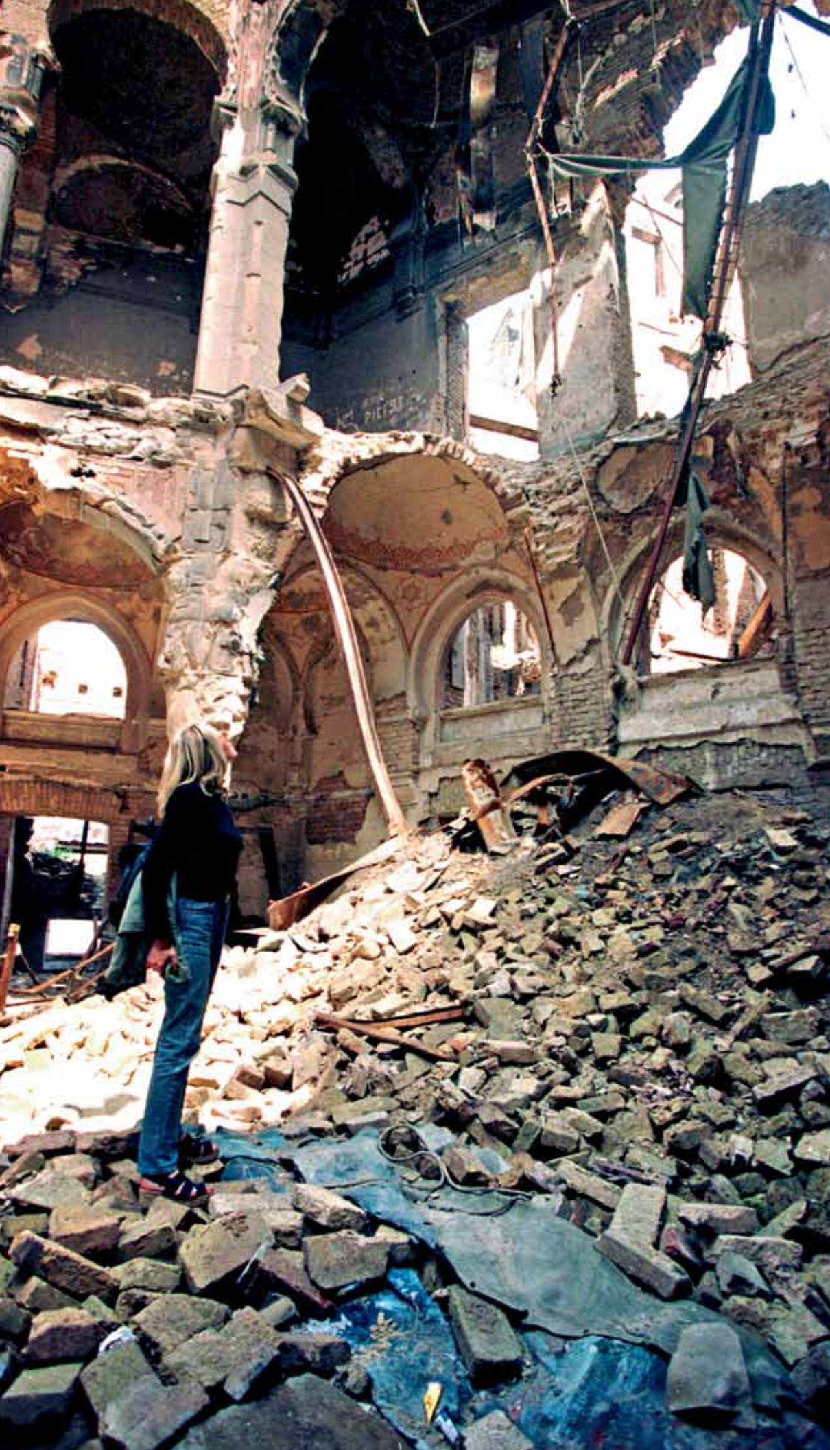
The ruins of Sarajevo's National Library following the Bosnian Serb bombardment of the Bosnian capital, May 1993.