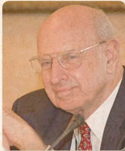
THOMAS R. PICKERING, CO-CHAIR

As the EU now enters a new phase in its external relations with the creation of new top-level foreign policy posts and a new diplomatic service, the resulting upheavals in the policymaking structures and personnel changes have the potential to end up in temporary distraction if not long-term dysfunction. Through these challenges, Crisis Group has been helping to push the EU to take on responsibility for crisis response and conflict management befitting the Union's immense financial engagement worldwide. This may be another long-term advocacy effort in which Crisis Group's perseverance will be necessary.