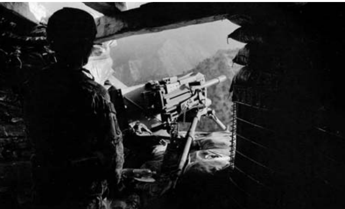
US soldier at observation post in the Korengal Valley, Kunar Province, Afghanistan, June 2007.

From modest beginnings in 1995 – two people in a London office and a tiny field staff in the Balkans – Crisis Group has grown into an organisation employing over 126 fulltime staff from some 49 different nationalities, speaking 49 different languages and working across five continents in over 60 areas of actual or potential conflict and from six major advocacy centres. With an annual budget in 2010 of over US$15 million – with a diverse funder base of governments, foundations, individuals and corporations – Crisis Group produces over 80 reports and briefing papers annually, together with its monthly CrisisWatch bulletins, and circulates them directly to some 26,000 specifically targeted recipients and over 130,000 online subscribers. Staff and Board members publish over 200 commentary articles in major newspapers each year, and in the same time frame, over two million visitors come to Crisis Group's website.