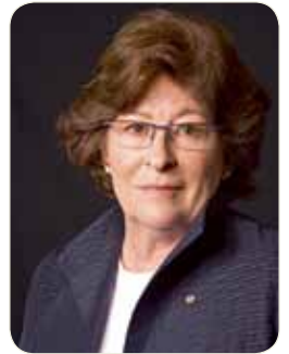
LOUISE ARBOUR President and CEO, International Crisis Group

Crisis Group will continue to thrive in this complex environment, and its influence will grow. Working on the ground, close to all but indebted to none, it will remain true to the vision that made it the splendid organisation that it is today.