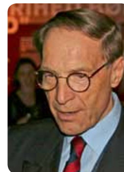
Crisis Group Board members Thorvald Stoltenberg and Pär Stenbäck.

and secured tax-exempt status in the United States. Among the first governments to give financial support to Crisis Group in the crucial years 1995 to 1996 were the Nordic ones, thanks in large part to the hard work of early Board members Pär Stenbäck and Thorvald Stoltenberg, the former foreign ministers of Finland and Norway respectively.