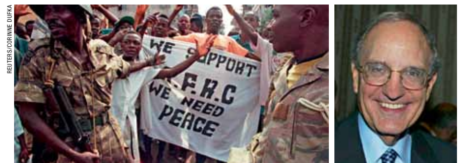
Residents of Freetown march in a rally for peace, Sierra Leone 8 June 1997. – Crisis Group’s first Chairman George Mitchell.

The first push was to rally international support for Sierra Leone’s elections: Crisis Group media advocacy helped raise $10 million for the election. In the aftermath of the polls, Crisis Group helped create and fund the Campaign for Good Governance that included training workshops for public officials and a civic education program. Many within the organisation felt this foray into programming was a distraction from the core mission, though there was at least one notable long-term benefit: Zainab Bangura, the leader of a women’s organisation Crisis Group had helped to establish back then, went on to become a prominent, passionate spokesperson for her country and today, in 2010, serves as Sierra Leone’s Foreign Minister.