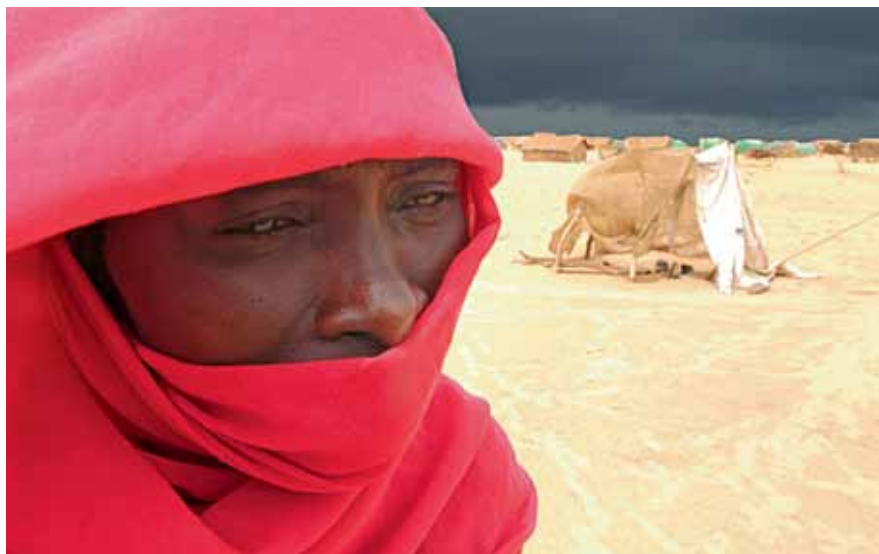
Darfur refugee in Touloum camp, Eastern Chad, July 2004.

But what most defined the organisation in 2003 and the years immediately following was the crisis in Sudan's western region of Darfur. The situation itself was the type of man-made disaster Crisis Group had been created to address, and indeed, when the Sudanese government reacted to insurgency in Darfur by supporting proxy militias who carried out mass violence and atrocities against the civilian population, Crisis Group was the first major international organisation to sound the alarm, in June 2003.